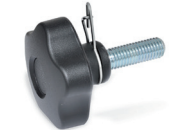
EN 5337.2 → page 602 EN 5337.7 → page 605 Size 32 ... 63 mm